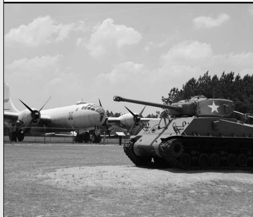
Photo: Airplane and armament display at the park Visitor Center.

A full-service marina will provide covered rental slips for up to 60 boats, with hookups for fresh water and electricity. For more information about the marina or to reserve rental space for your boat, contact 229-273-7747