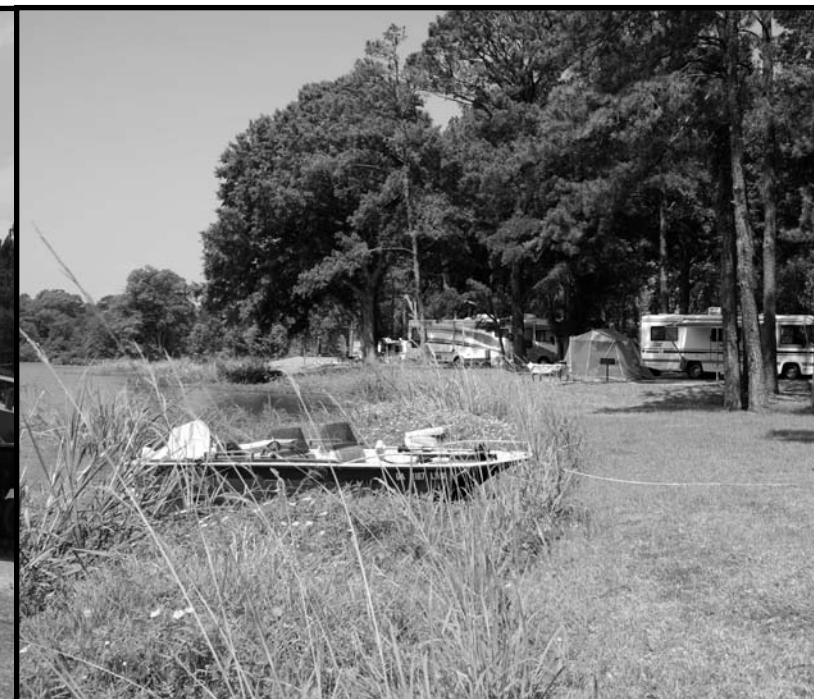
Photo: RV and tent campground on Lake Blackshear.